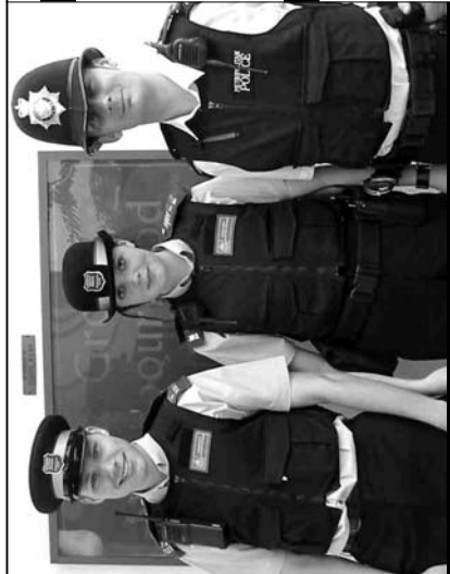
'BOBBY ON THE BEAT'